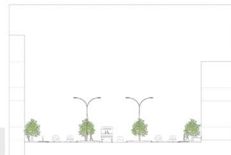
Detail at D