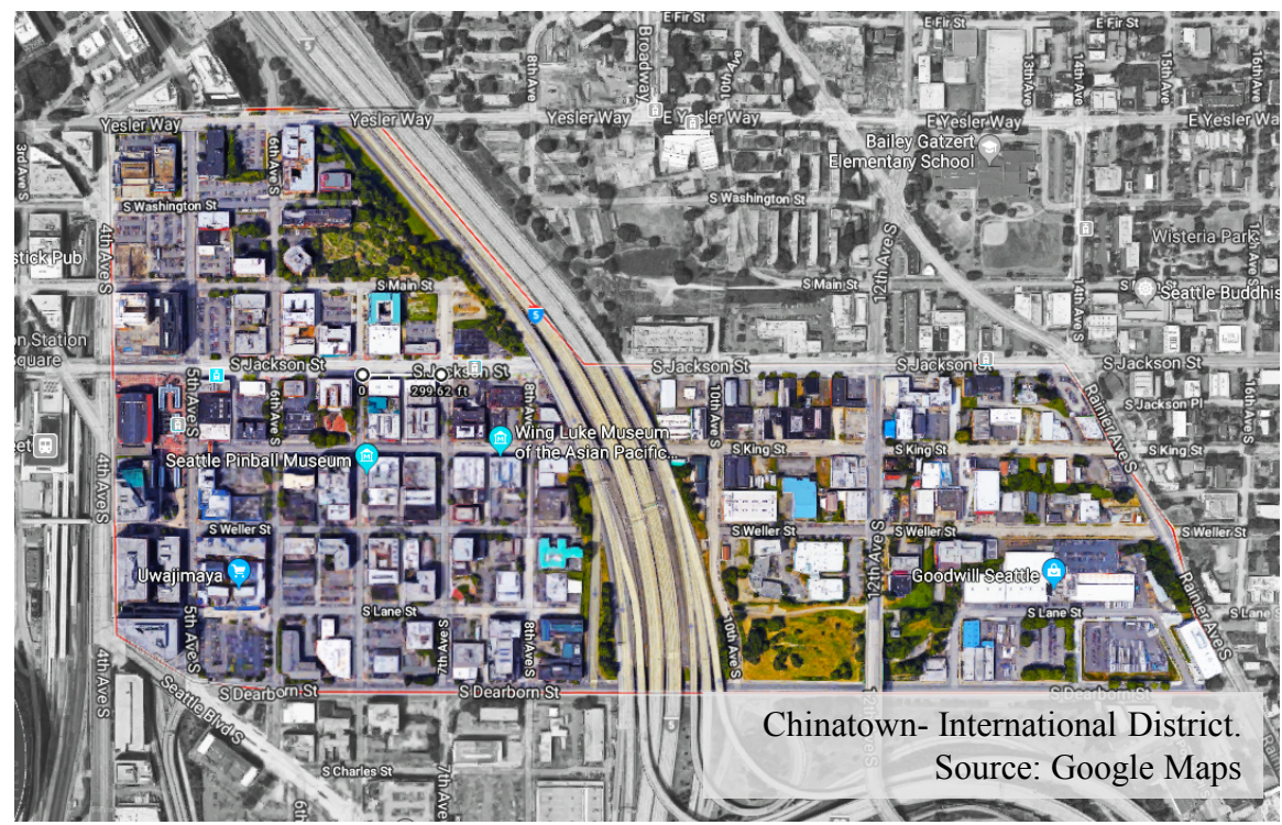
Chinatown- International District.